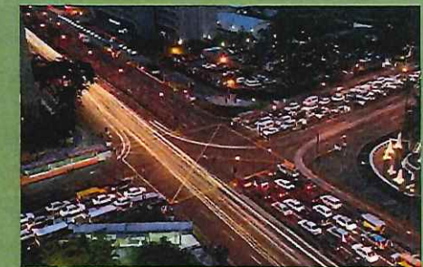
Adaptive signal control technologies can reduce stop time at intersections.

Split Cycle Offset Optimization Technique (SCOOT) is the most widely deployed adaptive system in existence. It was developed in the United Kingdom. The Sydney Coordinated Adaptive Traffic System (SCATS) was developed in Australia, and matches traffic patterns to a library of signal timing plans and scales split plans over a range of cycle times. Another effective system is the Real Time Hierarchical Optimized Distributed Effective System (RHODES), which uses a peer-to-peer communications approach to communicate traffic volumes from one intersection to another in real time. There are many others in existence and in development.