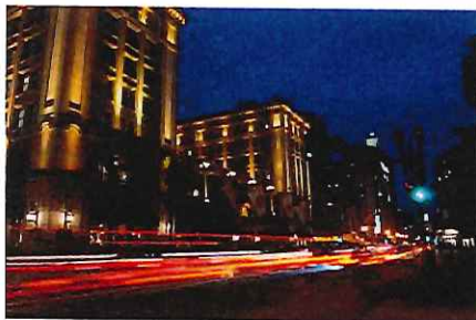
Traffic flows smoothly through green lights.

To learn more about EDC, visit: http://www.fhwa.dot.gov/everydaycounts