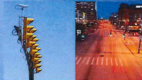
A wide variety of adaptive signal control technologies are available to operate in varied environments.

The traditional signal timing process is time-consuming and requires substantial amounts of manually collected traffic data. Traditional time-of-day signal timing plans do not accommodate variable and unpredictable traffic demands. This results in customer complaints, frustrated drivers, excess fuel consumption, increased delays, and degraded safety. Customer complaints is the most frequently cited performance measure in operations surveys conducted by the FHWA. In the absence of complaints, months or years might pass before inefficient traffic signal timing settings are updated. With adaptive signal control technologies, information is persistently collected and signal timing is updated continually.